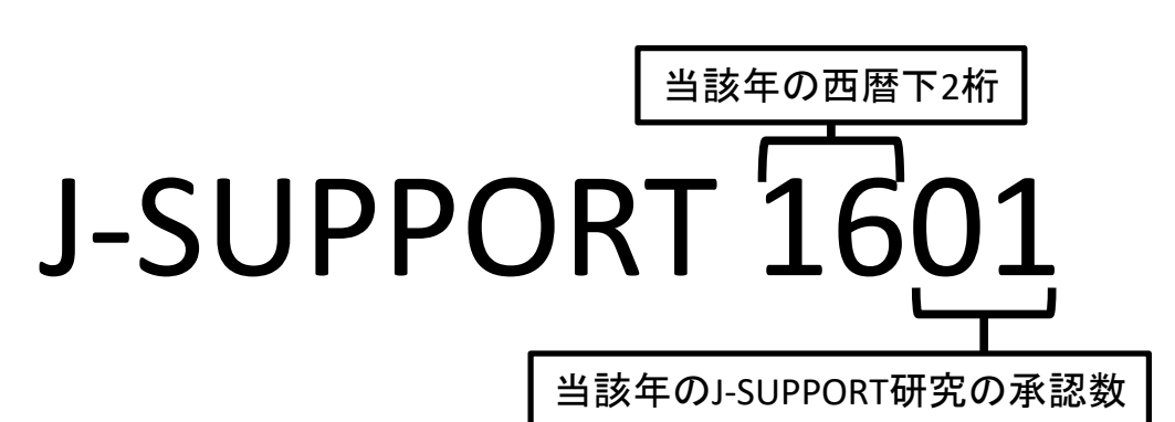
Figure 2. J-SUPPORT research number allocation example